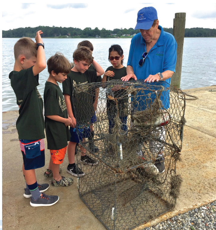
Children learning about crabs during ECOCAMP

The summer program is a modification of NRPA's signature Nansemond Watershed Initiative: Connecting the Classroom with the Environment. That initiative educates 1,500 K-12 students during the school year, and now NRPA's summer programs reach an additional 200 children through the exciting projects highlighted below.