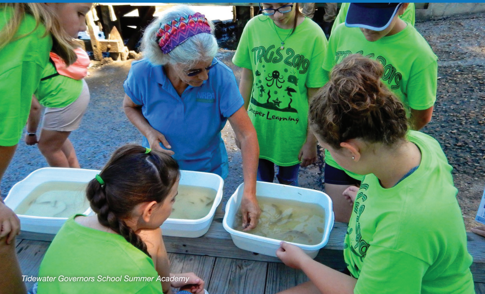
Tidewater Governors School Summer Academy

marine critters. NRPA explained the anatomy and special purpose of each critter and then released them all back into the creek. The students also observed the use of water quality testing instruments and learned about the negative impact of stormwater runoff on the Creek. Then the students were transported by bus to an NRPA member's private home located along Hoffler Creek to learn about oysters. The program included a visit to the NRPA oyster reef sanctuary, with extensive education about the bi-valves, their life-cycle and the important role they play in filtering the Creek water.