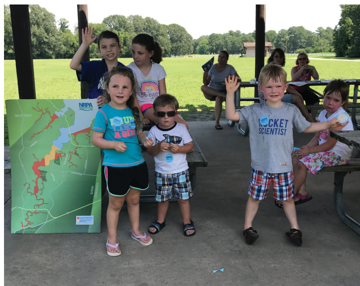
NRPA Junior Members during the Bethlehem Church Family Picnic

Eight 3 – 6-year olds along with their parents, and in 95 degree temperatures, participated in a challenging environmental scavenger hunt at Sleepy Hole Park. NRPA hosted the hunt as part of the church's family picnic. The children and adults learned about native shrubs and trees, the history of the River and the status of Suffolk's waterways. The session ended with the youth receiving the official NRPA sticker and being sworn in as proud NRPA junior members.